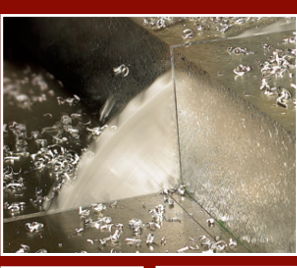
Plate Sheet Rod Tube

Naval Brass Copper-Nickel Muntz Metal Brass & Bronze Cartridge Brass